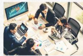
Business Expansion, Innovation and Global Opportunities

Eligibility: A Recognised Bachelor's Degree with minimum 50% Marks