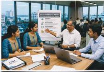
Foundations of Family Business Management