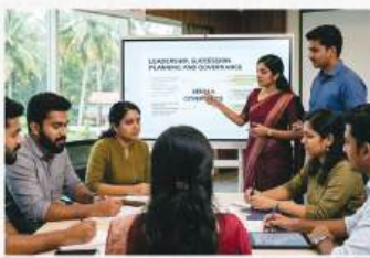
Leadership, Succession Planning and Governance

This course provides students with fundamental knowledge and basic tools to build an enlightened understanding of how to work entrepreneurially and professionally, in and with family firms, and manage the unique challenges and dilemmas faced by family businesses effectively. Topics covered include fundamentals of management and economics in the context of family firms, family business governance, innovation, growth and entrepreneurial management, introduction to succession and generational transitions, family-centered goals and goal setting processes, strategic management and decision making in family firms, internationalization, stakeholder management and fundamentals of family business branding.