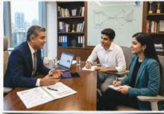
Entrepreneurship and Strategic Business Planning