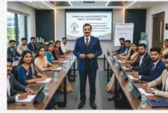
Financial Management for Family Enterprises

This course provides students with fundamental knowledge and basic tools to build an enlightened understanding of how to work entrepreneurially and professionally, in and with family firms, and manage the unique challenges and dilemmas faced by family businesses effectively. Topics covered include fundamentals of management and economics in the context of family firms, family business governance, innovation, growth and entrepreneurial management, introduction to succession and generational transitions, family-centered goals and goal setting processes, strategic management and decision making in family firms, internationalization, stakeholder management and fundamentals of family business branding.