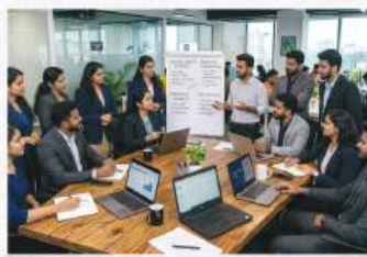
Marketing, Branding and Digital Business Growth